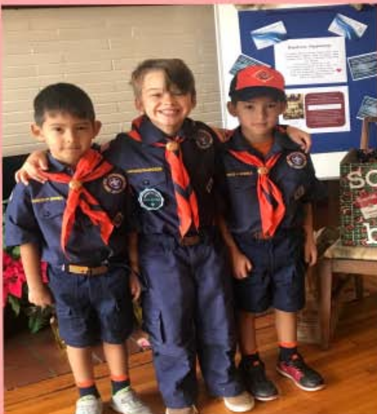
The scouts and families were with us Sunday the 4th. We love and support our scouts.

The Gasparilla Parking Fundraiser was a huge success! We sold out tickets for both days.