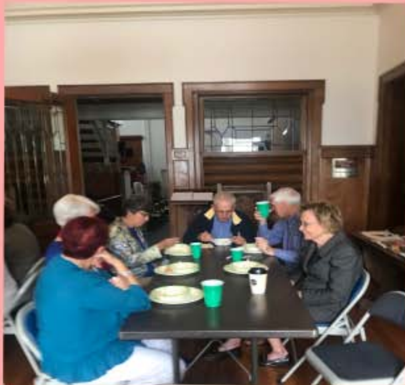
Souper Sunday Luncheon