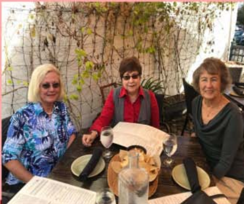
Our Birthday girls at their annual lunch.