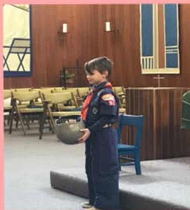
One of the scouts held the helmet for Souper Sunday collections for the Beth - El mission!